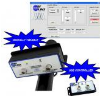
2400 LT Series 2.4GHz WLAN Tunable Amplifier